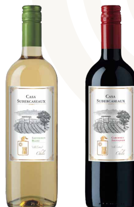
CASA SUBERCASEAUX Sauvignon Blanc Central Valley | Chile

Greenish pale yellow. Fruity nose with notes of herbaceous and peaches aroma. Refreshing, balanced and semi-dry palate.