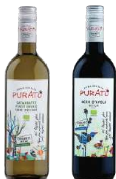
PURATO 900,000 Catarratto, Pinot Grigio - IGT Terre Sicilia | Italy

Straw yellow in colour. The bouquet shows tropical fruit with hints of citrus. The palate is perfectly balanced by a backbone of acidity and minerality.